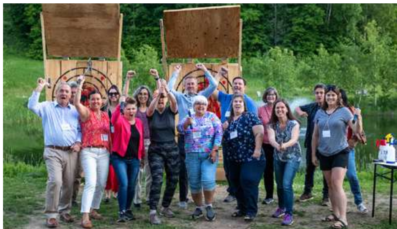
Group photo taken during June 2022 Annual General Meeting at Calabogie Peaks.

None of our achievements would have been possible without the tireless dedication and passion of our eastern Ontario CFDC staff and Boards. With the support of our members, partners, volunteers, and staff, we are confident that we can continue to drive positive change in the business community and create a more vibrant and prosperous economy for all. We extend our deepest gratitude to each of you for your support, active participation, and valuable contributions. Together, we have built a community that is driven by shared purpose.